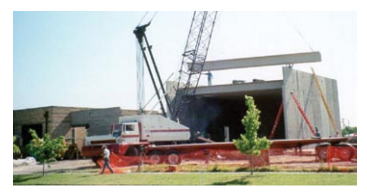
Community storm shelter being constructed to FEMA 361 criteria in Wichita, Kansas.

Buildings are designed to withstand a certain wind speed (termed "design [basic] wind speed") based on historic wind speeds documented for different areas of the country. The design wind speed used in conventional construction in the Midwest is a 90 mph, 3-second gust. By contrast, the design wind speed recommended by FEMA<sup>1</sup> for shelters in this same area is a 250 mph, 3-second gust to provide "near-absolute protection."<sup>2</sup>