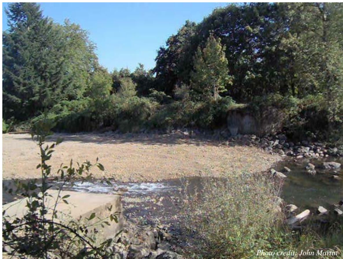
Figure 18. Calapooia River, September 2007 immediately following dam removal.

You may decide to have a final site tour following the project's completion. Members of your technical team and local community may want to hear about the removal process (how many tons of concrete were removed, what fish were found during de-watering, etc.) and want to view the site in its new condition. This is also a good time to reflect on the project and lessons learned and glean any insights that may help ease the way for future dam removal projects. Should you remove a dam in your watershed, send your lessons learned to hofferthay@peak.org . This guide will be updated periodically at which time your lessons learned can be included.