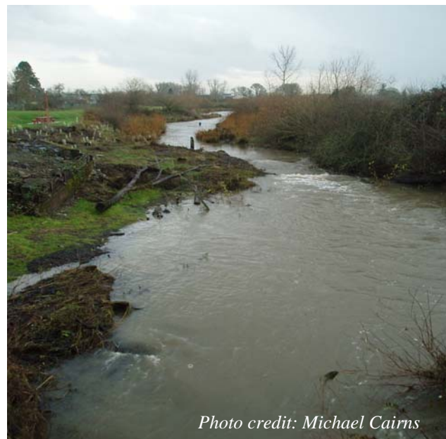
Figure 8. South Fork Ash Creek. post dam

The timeline lays out the elements of the SOW along with the anticipated time required to complete each element. Be sure you are aware of any time constraints including funding sources, in-water work window, and permit timing. The design process, public meetings, or permitting may take longer than you anticipate, especially if any previously unknown issues are revealed during the design process (e.g., historic artifacts, wetlands, unhappy adjacent landowners). Keep an eye on the project timeline throughout your project. This may be one of a dozen or more projects your contractors are working on. If you have timeline constraints, keep them aware of that. If deliverables are not being met on time, request a meeting right away to assess any changes that are necessary to the remaining tasks and timeline to keep the project on schedule. It is the project manager's responsibility to keep the project on schedule.