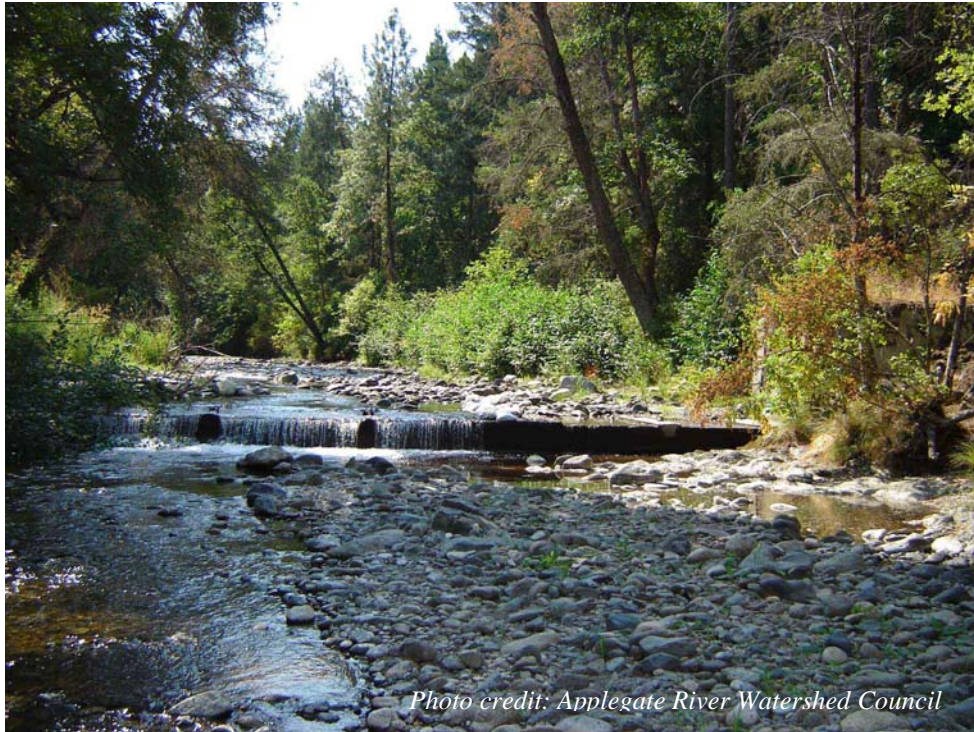
Figure 15. Buck and Jones Dam, Applegate Watershed prior to removal