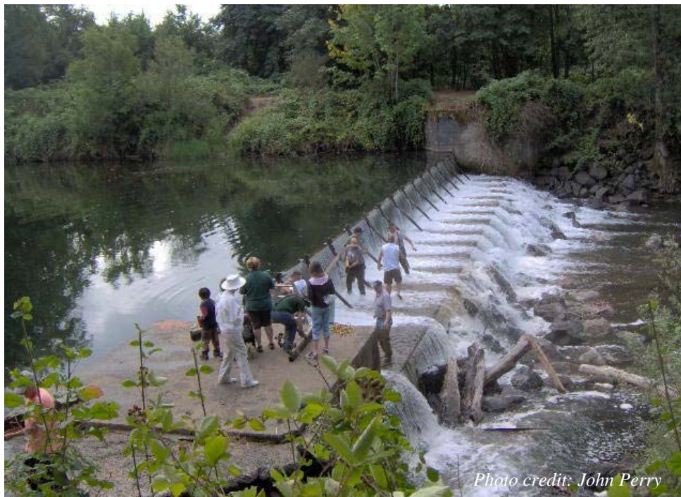
Figure 1. Removing the flashboards from Brownsville Dam, August, 2007.