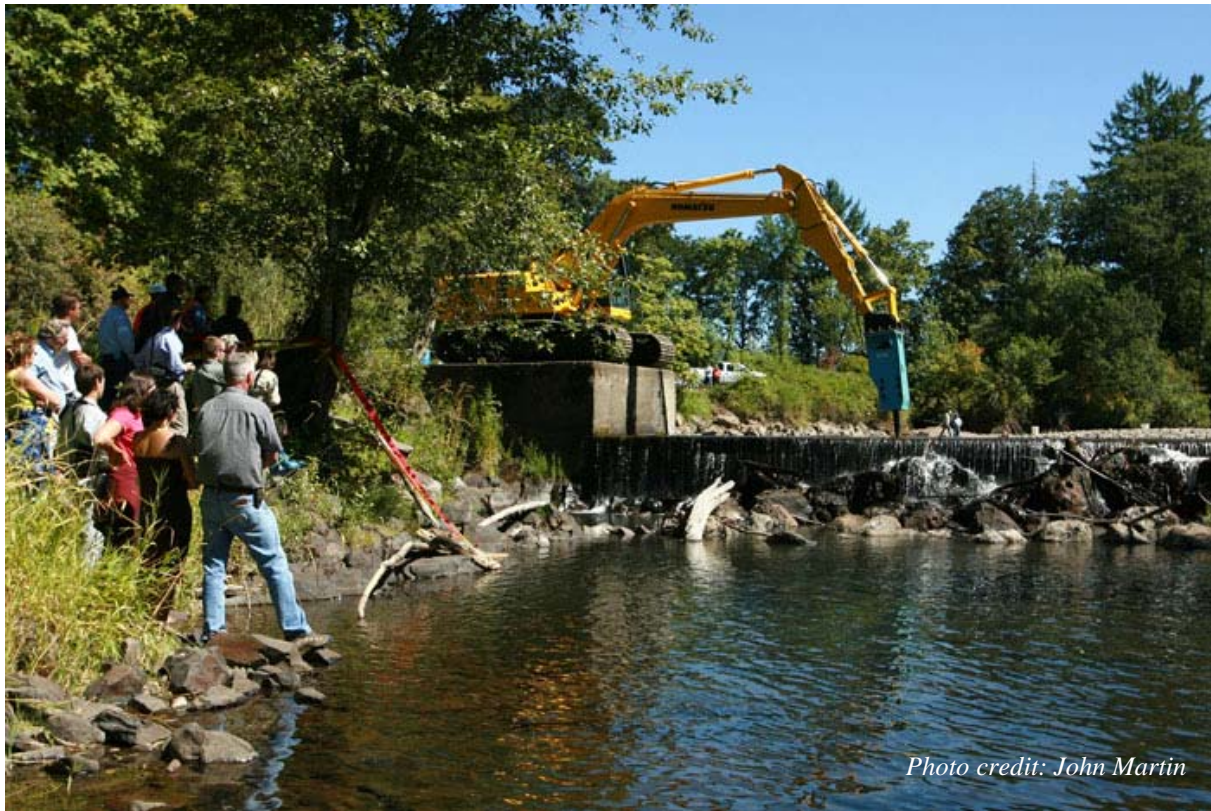
Figure 17. Demolition of Brownsville Dam commences, August 27, 2007