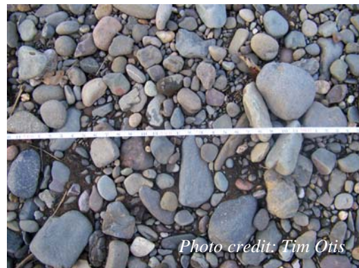
Figure 12. Sediment stored behind Brownsville Dam