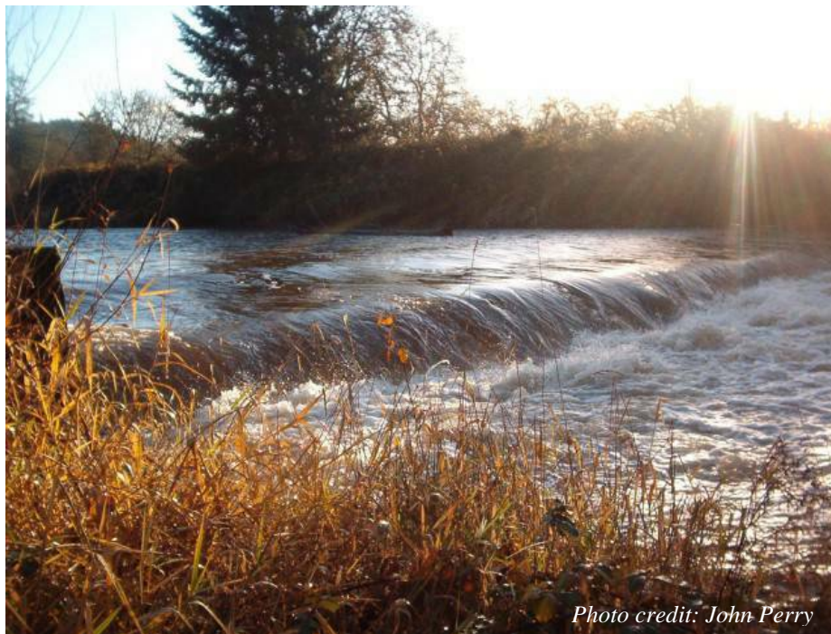
Figure 3. Brownsville Dam, December 6, 2003 during a 2-year rain event.