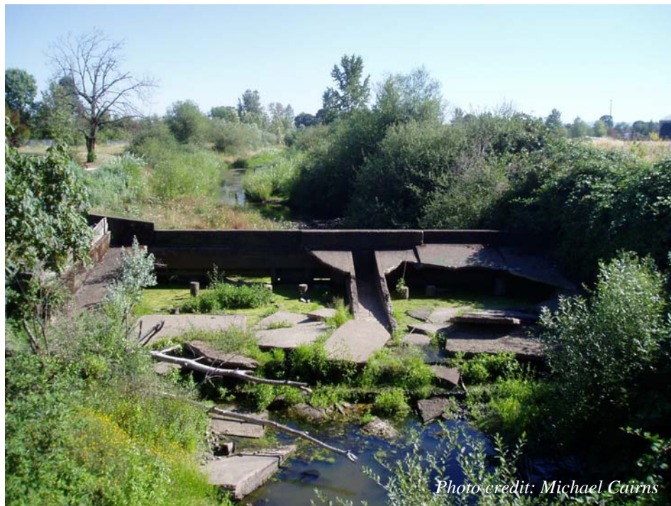
Figure 7. South Fork Ash Creek, Mount Fir Mill Dam, Luckiamute Watershed

Appendix C shows a decision checklist the Brownsville Dam project used to assist their interview committee in deciding which firms to interview. Appendix D is the information the project provided to the top three candidates prior to their interviews so they would come to the interview prepared. Appendix E is the questions and decisions matrix used by the interview committee during the interviews to assist in making their decision.