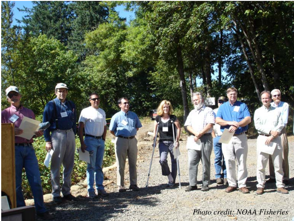
Figure 4. Members of the Brownsville Dam technical team at the dam's breaching ceremony, August 27, 2007.