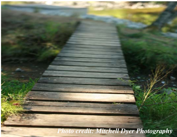
Figure 5. Walkway at former Brownsville Dam site