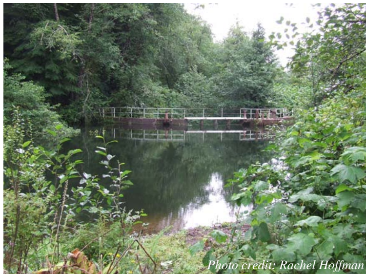
Figure 10. Coal Creek dam prior to removal