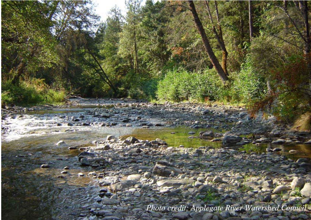
Figure 16. Applegate River tributary following removal of Buck and Jones Dam in 2006