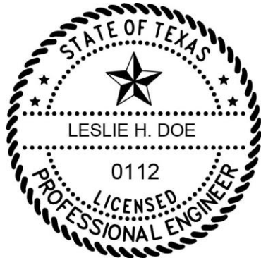
Figure: 22 TAC §137.31(c)