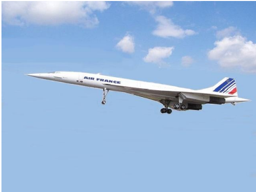
Figure 3. Concorde

On July 25, 2000, an improperly installed 1.1 m by 0.33 m titanium strip fell off a Continental Airlines DC-10 as it took off from Charles de Gaulle Airport near Paris. The strip lay unnoticed on the runway a few minutes later as a supersonic Concorde passenger airliner sped along the same runway prior to take-off. Because Concorde's wings were designed to develop lift efficiently at supersonic speeds rather than at lower speeds, take-off and landing speeds were much higher than those of subsonic airliners, and the Paris Concorde was traveling at a speed of about 210 miles per hour when one of its tires ran over the strip [24-FAQs]. The tire burst and pieces of tire were thrown violently against the underside of the wing. A fuel tank contained in the wing began to leak, and the leaking fuel then caught fire as the plane was leaving the ground. The airplane flew on for about a minute but lost engine thrust and crashed into a hotel, killing all 100 passengers, nine crew members, and four people in the hotel. [8, p. 175; 19, return to flight, Ch. 2]