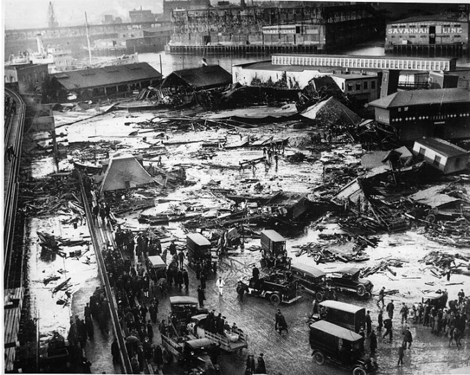
Figure 1. Aftermath of molasses tank failure

Around mid-day on January 15, 1919, in Boston's North End, a large molasses storage tank—50-ft high and 90-ft in diameter—burst with a long rumbling sound and a noise like a machine gun as rivets popped out of the steel walls. Molasses released from the tank formed an 8 to 15-foot high wave traveling at 35 mph throughout the surrounding neighborhood, smashing railroad cars, lifting buildings off their foundations, and bending girders of a nearby elevated railroad. After the wave died out, a pool of molasses about 4 feet deep extended for 300 feet from the tank and then thinned out with further distance from the tank. People and horses caught by the wave fought to escape but only sank further into the sticky liquid. The final human toll was 21 people dead and 150 injured. About half of the deaths occurred the day of flood as a result of drowning or being crushed by the wave's impact; the other half of the deaths occurred in the following days as a result of injuries and infections. [11, 12, 13]