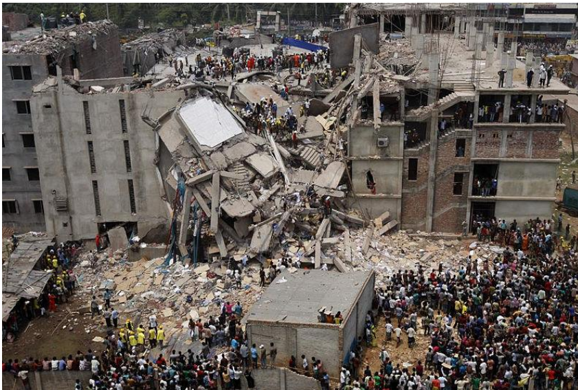
Figure 2. Aerial view of collapse.

On April 24, 2013, one of the deadliest structural failures in history occurred in an industrial suburb of Dhaka, Bangladesh. An eight-story reinforced concrete building housing shops, apartments, a bank, and—most significantly—five garment factories collapsed, killing 1,129 people and injuring approximately 2,000. Investigations after the collapse revealed many irregularities. [16, 17]