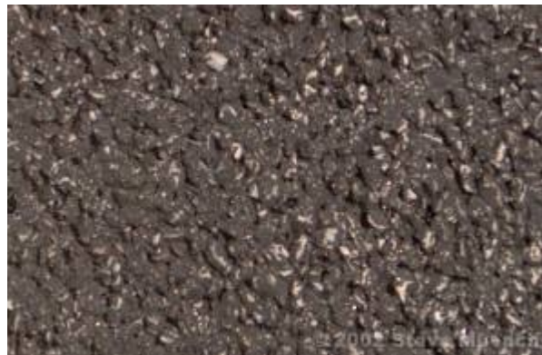
(Steve Muench; hawaiiasphalt.org)

Open-graded friction courses (OGFC) have been used across the U.S. since the 1950's to improve the surface frictional resistance of asphalt pavements. In 1974, the Federal Highway Administration (FHWA) developed an OGFC mix design procedure to be used by state departments of transportation (DOTs). At first, many DOTs reported good performance using OGFC but others stopped using these mixes due to unacceptable performance. Since then, many significant improvements have been made in the areas of OGFC gradation and binder type.